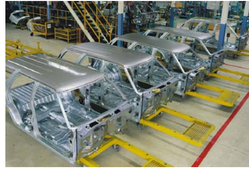
From paint curing to thermoforming, noncontact temperature measurement provides consistent product quality in the automotive industry.